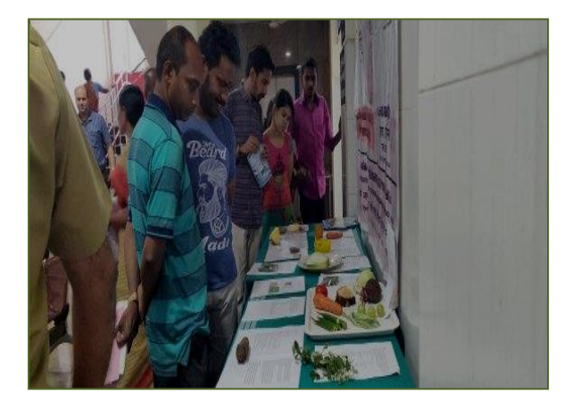
Exhibition on healthy diet organized as a part of "Poshan Pakhwada" by RARILSD, Thiruvananthapuram