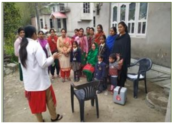
Awareness lecture on Importance of Nutritional food during Pregnancy and Lactation and Role of Nutritional food in Immunity during Poshan Pakhwada at RARIND, Mandi