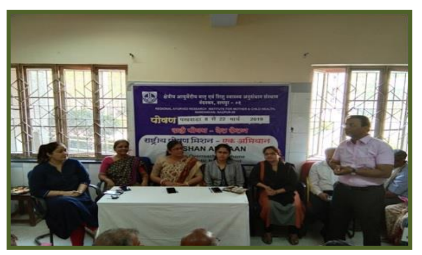
Lecture on Ayurvedic pathya apathya vivechana, Importance of nutrition in mother and child at RARIMCH, Nagpur

On the occasion of first anniversary of National Nutrition Mission "Poshan Pakhwada" was celebrated from 8<sup>th</sup> to 22<sup>nd</sup> March 2019 in all the peripheral institutes of the Council. Under this programme, various public lectures/classes regarding the importance of healthy, nutritious diet for all age groups with special focus on infant and child nutrition were organized within the Institute and in the periphery through outreach programs. Reports were received from RARIMCH, Nagpur; RARIMD, Bengaluru; RARILSD, Thiruvananthapuram; RARISD, Vijayawada; RARIND, Mandi; NARIP, Cheruthuruthy; MSRARIED, Jaipur, NIIMH, Hyderabad; CARIRD, Patiala etc.