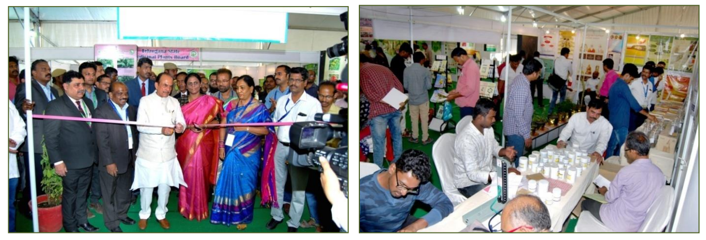
Hon'ble Home Minister, Govt. of Telangana, Md. Mahmood Ali, inaugurating the stall of NIIMH, Hyderabad (Right) Free distribution of medicines to the patients during Arogya Fair

A team of Officers and officials from the institute participated in state level AROGYA FAIR at Necklace Road, Hyderabad (Telangana) from 15<sup>th</sup> to 17<sup>th</sup> February 2019, which was organized by PHD Chambers of Commerce and Industry. Institute's stall was inaugurated by Sh. Md. Mahmood Ali, Hon'ble Home Minister, Govt. of Telangana on 15<sup>th</sup> February 2019. Institute conducted clinic and distributed free medicines, displayed exhibits, and sale of publications in the stall.