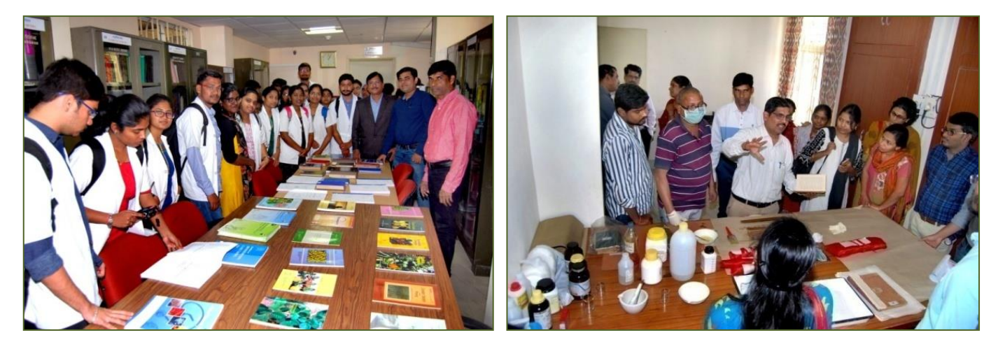
JSPS Govt. Homoeopathic Medical College, Hyderabad, students and Faculty viewing the Publications Books at NIIMH library

A team of Officers and officials from the institute participated in state level AROGYA FAIR at Necklace Road, Hyderabad (Telangana) from 15<sup>th</sup> to 17<sup>th</sup> February 2019, which was organized by PHD Chambers of Commerce and Industry. Institute's stall was inaugurated by Sh. Md. Mahmood Ali, Hon'ble Home Minister, Govt. of Telangana on 15<sup>th</sup> February 2019. Institute conducted clinic and distributed free medicines, displayed exhibits, and sale of publications in the stall.