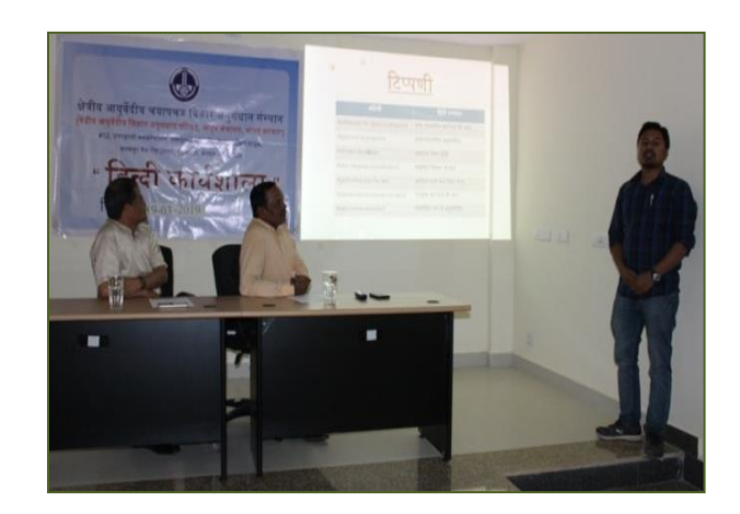
PowerPoint presentation on the topic entitled Noting in Hindi at RARIMD, Bengaluru