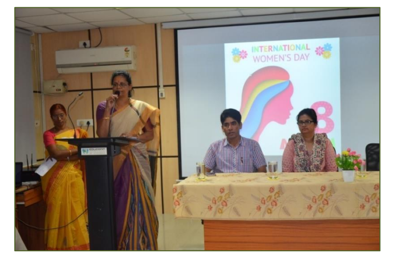
Glimpse of International Women's Day Celebration at CSMRADDI, Chennai