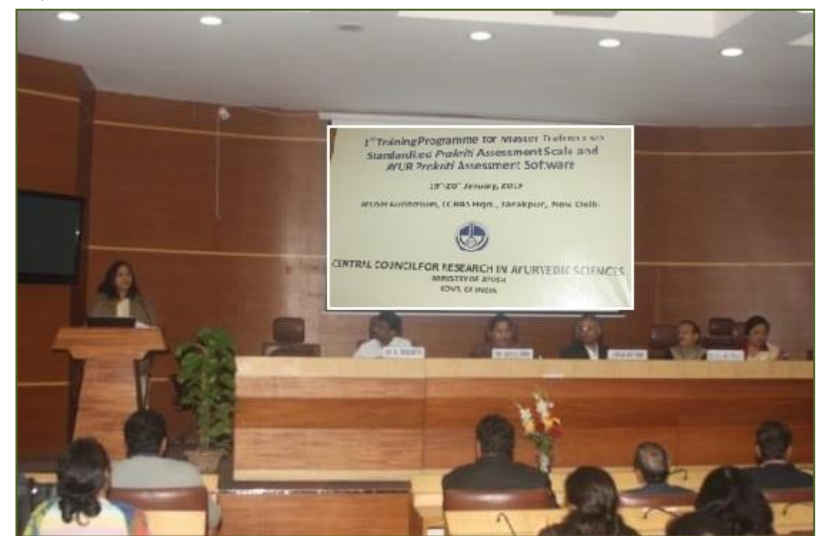
CCRAS Headquarters, New Delhi