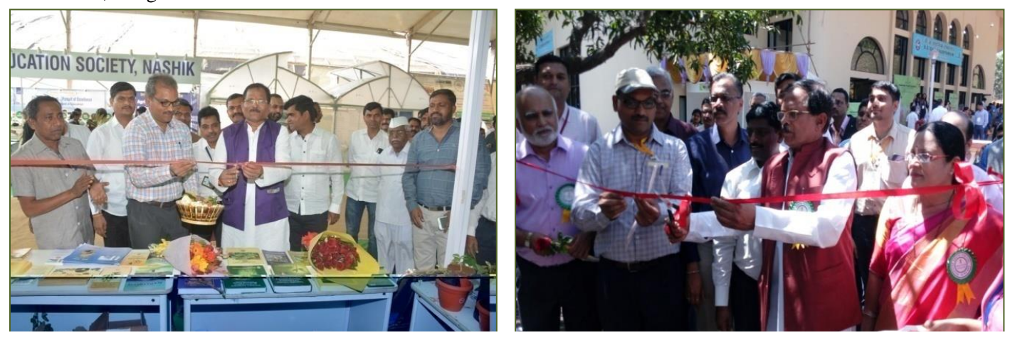
Glimpses of Hon'ble Minister of State (IC), Ministry of AYUSH, Shri Shripad Yesso Naik inaugurating "Global Agricultural Festival 2019" and (Right) "Ayurveda Youth Festival 2019"

Regional Ayurveda Research Institute for Metabolic Disorders, Bengaluru's new Hospital Block inaugurated by Shri D. V. Sadananda Gowda, Hon'ble Minister for Statistics and Programme Implementation, Shri Shripad Yesso Naik, Hon'ble Minister of State (IC) Ministry of AYUSH, Shri E. Tukaram, Hon'ble Minister for Medical Education, Govt. of Karnataka in the presence of Prof. Vaidya K. S. Dhiman, Director Gerneral, CCRAS and other dignitaries at RARIMD, Bengaluru.