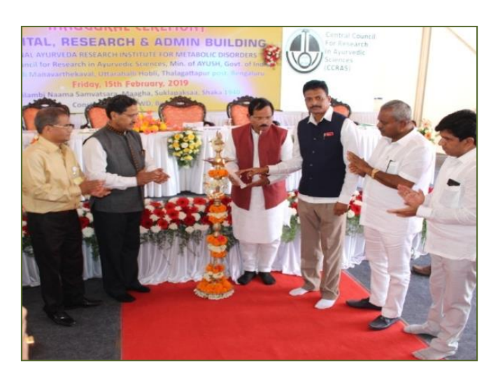
Inauguration of Hospital Block by Shri D V Sadananda Gowda, Hon'ble Minister for Statistics and Programme Implementation, Shri Shripad Yesso Naik, Hon'ble MoS (IC) MoA, Shri E. Tukaram, Hon'ble Minister for Medical Education, Govt. of Karnataka and other dignitaries at RARIMD, Bengaluru

Regional Ayurveda Research Institute for Metabolic Disorders, Bengaluru's new Hospital Block inaugurated by Shri D. V. Sadananda Gowda, Hon'ble Minister for Statistics and Programme Implementation, Shri Shripad Yesso Naik, Hon'ble Minister of State (IC) Ministry of AYUSH, Shri E. Tukaram, Hon'ble Minister for Medical Education, Govt. of Karnataka in the presence of Prof. Vaidya K. S. Dhiman, Director Gerneral, CCRAS and other dignitaries at RARIMD, Bengaluru.