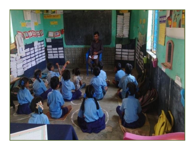
Awareness Programme for students about Dietetics and nutrition organised by RARIMD, Bengaluru