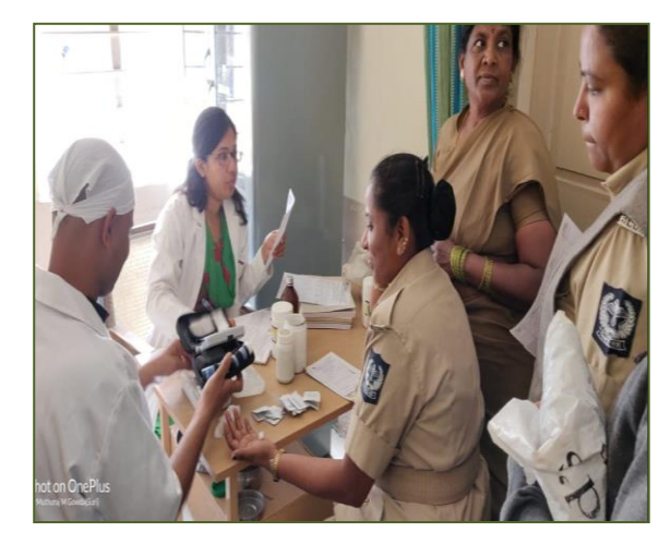
THCRP team members conducted free medical camp. (Right) Hemoglobin test conducted by SRP team for home guards at RARIMD, Bengaluru